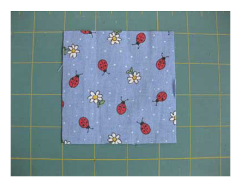
1. Cut a scrap of fabric to 3½" square.

All you need for this practical little pincushion is a small square of fabric, some filling, a tiny bit of sewing.... and you're set!